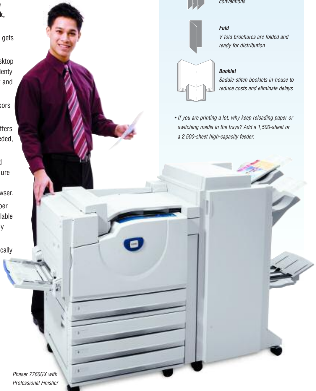
Phaser 7760GX with Professional Finisher