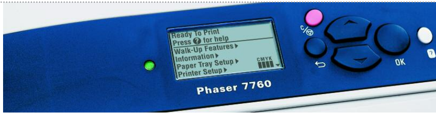
Large, six-line control panel gives quick access to all print functions and provides help solutions if needed.