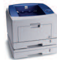
Phaser 3435 shown with optional Tray 2